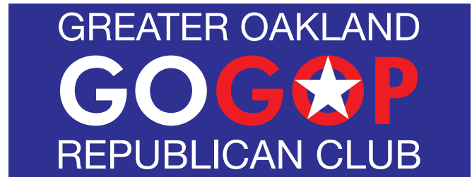
Left Chest Embroidery (Blue)