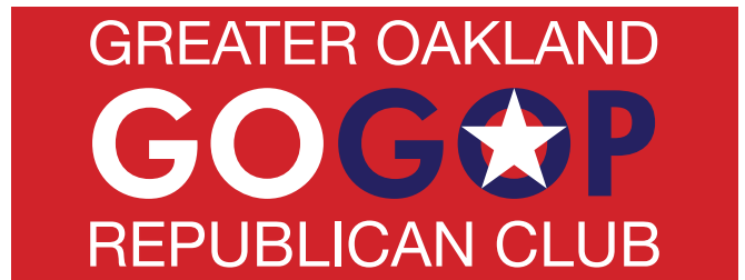
Left Chest Embroidery (Red)